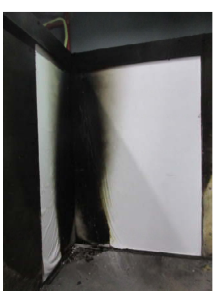
After Test (EN 13823)